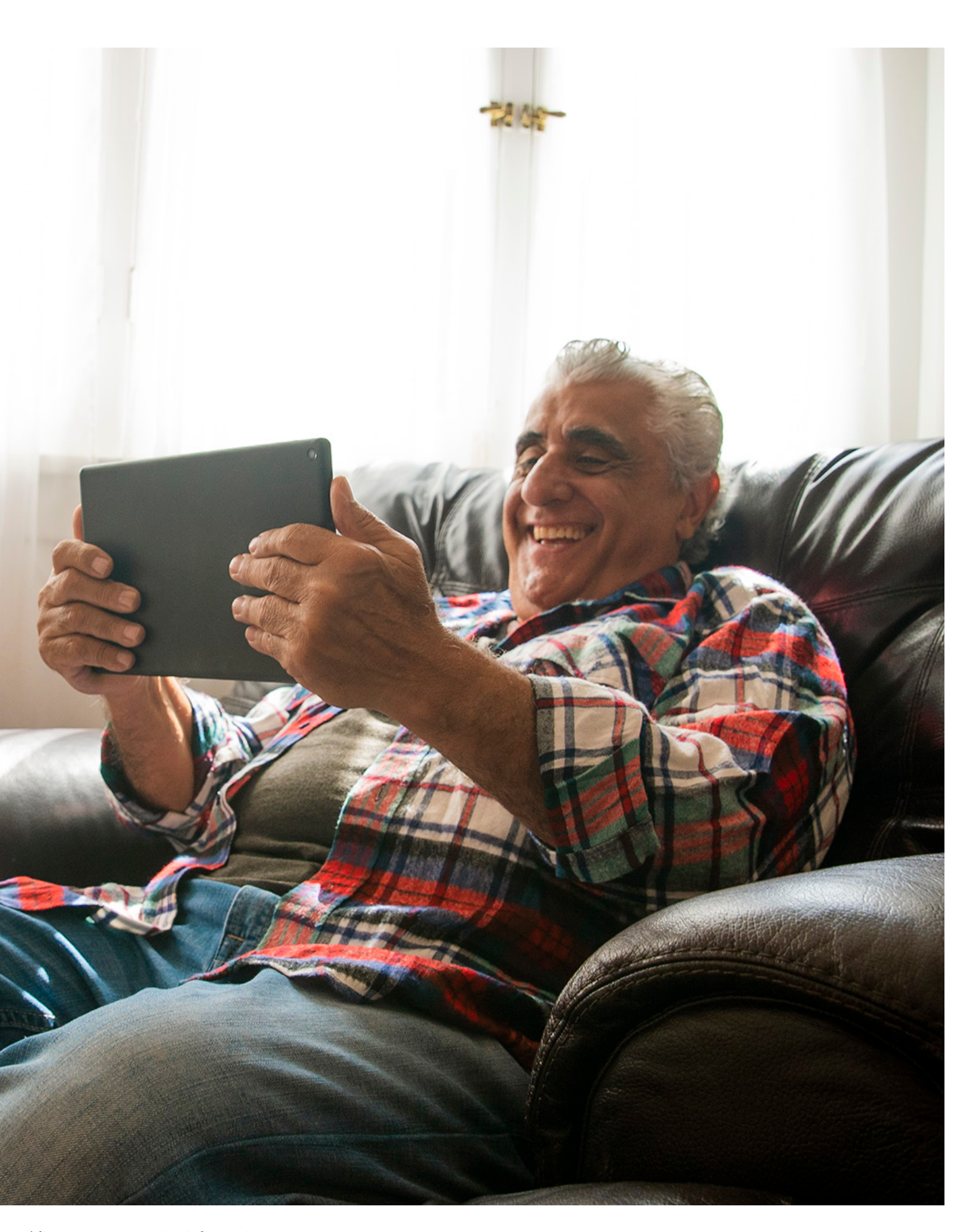
, and fitness programming information.